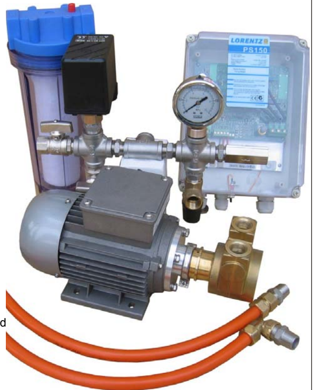
PS150-Boost with Installation Kit #2065 and Inline Filter #2075